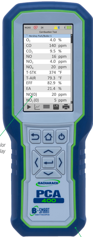
Large color touch display